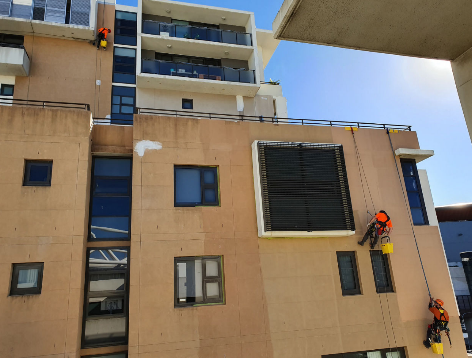
Rope Access technicians descending down the façade painting the first protective coating.