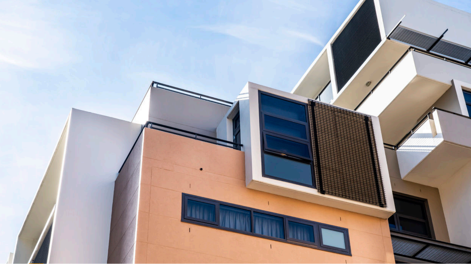
Completed project – Showing our technicians quality workmanship