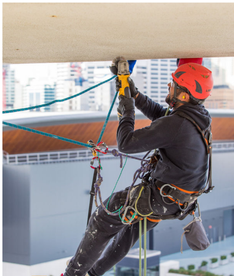
Our painters used advanced rope access techniques to access some extreme areas of the building