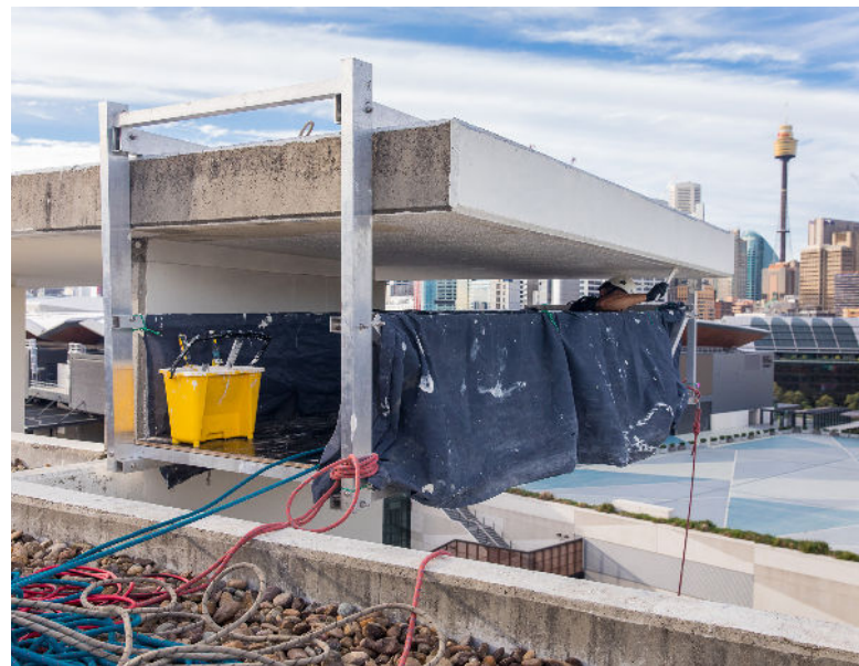
Behind the scenes of the famous encapsulated platform