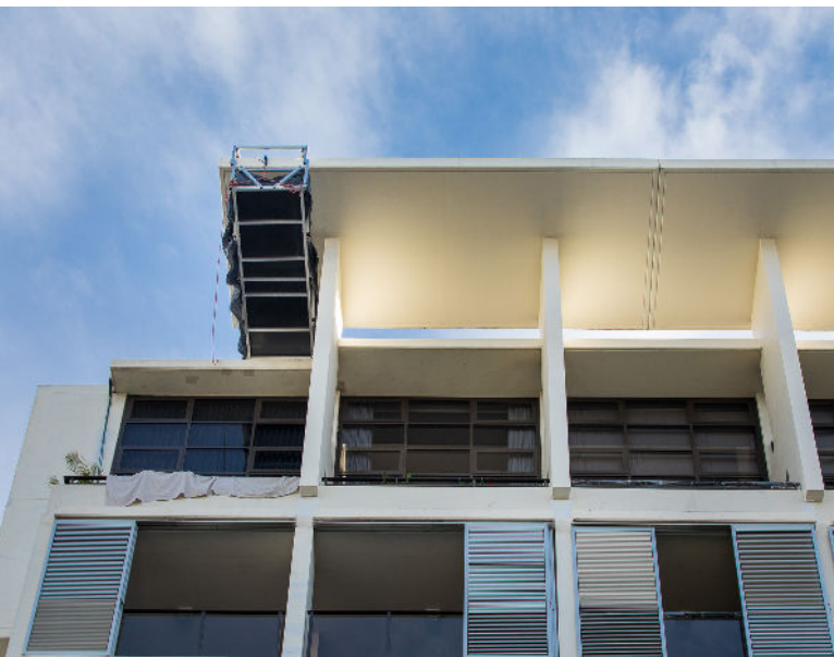
Encapsulated platform in use