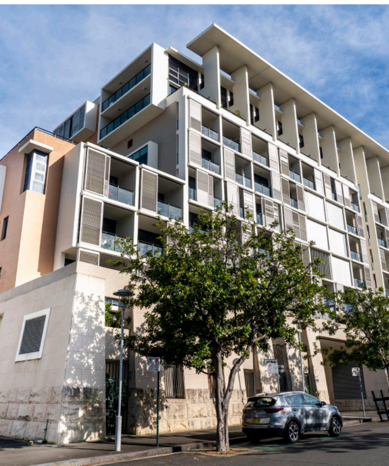
Finished painted façade