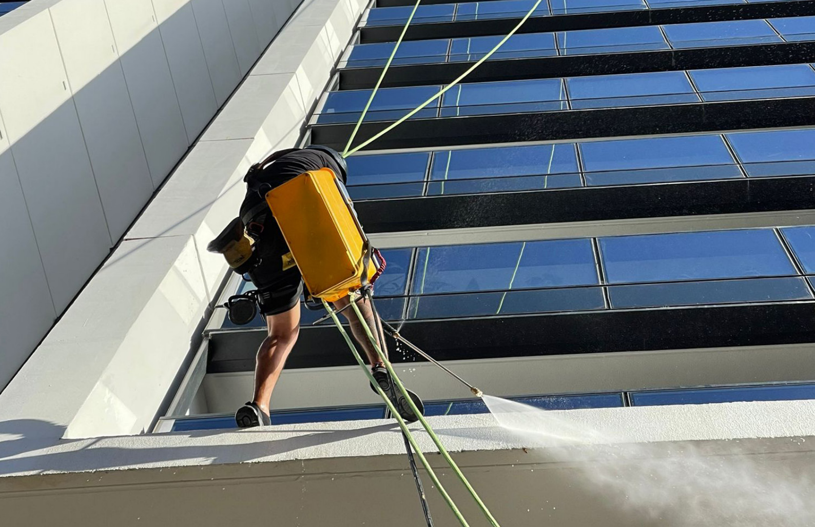
High rise rope access technician pressure washing the facade